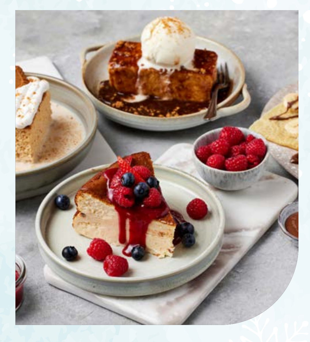
G Gluten | N Nuts | D Dairy | S Seafood | E Egg | V Vegetarian